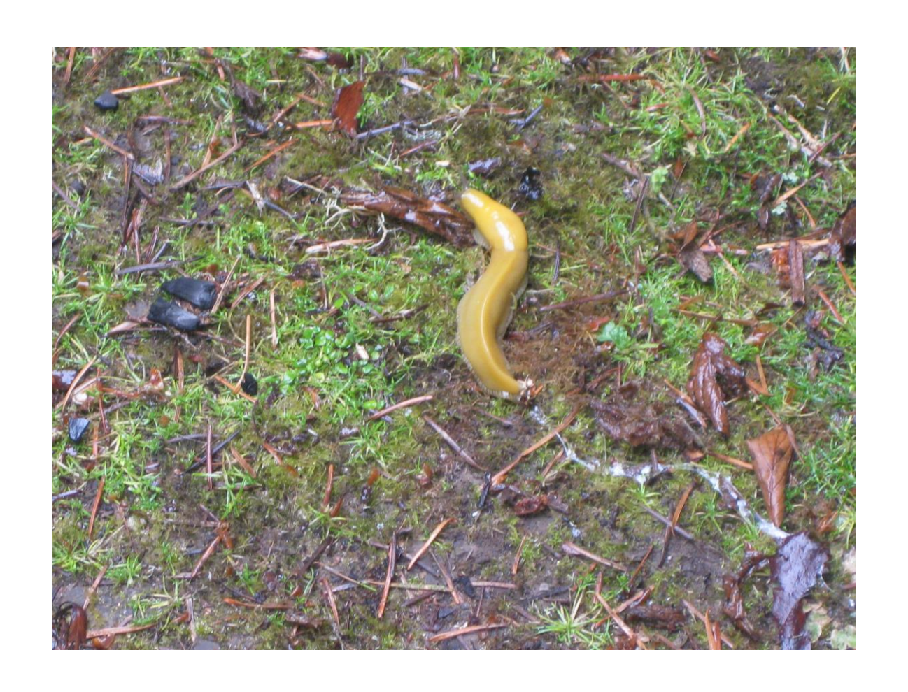
Nothing Provided by Banana Slugs EW!